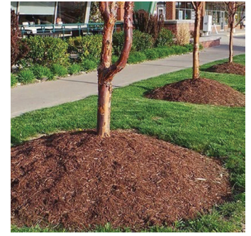
Too deep, over mulched