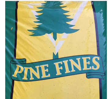
Best mulch type