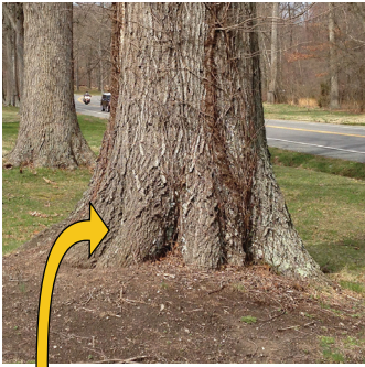
Good root flare