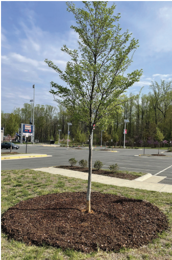
Good mulching: away from trunk, less than 3" deep, and beyond the drip line